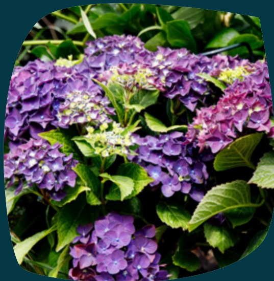
Music Collection® Deep Purple

IPM Essen - 2015 HTA National Plant Show UK - 2015 GLAS (Ireland) - 2015 HTA National Plant Show UK - 2015 Plantarium - 2015 Plantarium - 2015 Four Oaks Trade Show - 2015 HTA National Plant Show UK - 2016 HTA National Plant Show UK - 2016 HTA National Plant Show UK - 2016 Plantarium - 2016 Plantarium - 2017 Chelsea Flower Show - 2018 GLAS (Ireland) - 2018 Spring Challenge KVBC - 2021