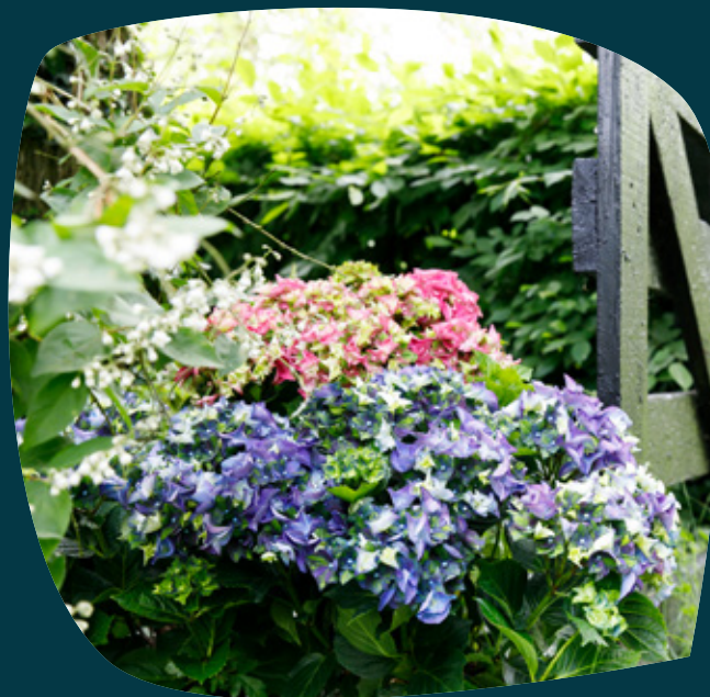
Lady Mata Hari® Blue & Pink